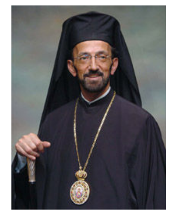
Enthronement April 2, 2005