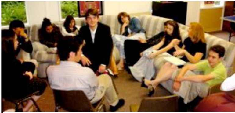
Left: Teens from the Holy Apostles’ “OASIS” class.

“Instead of having classes every Sunday for 10 months, we break it up, offering six 6-week sessions during the year.”